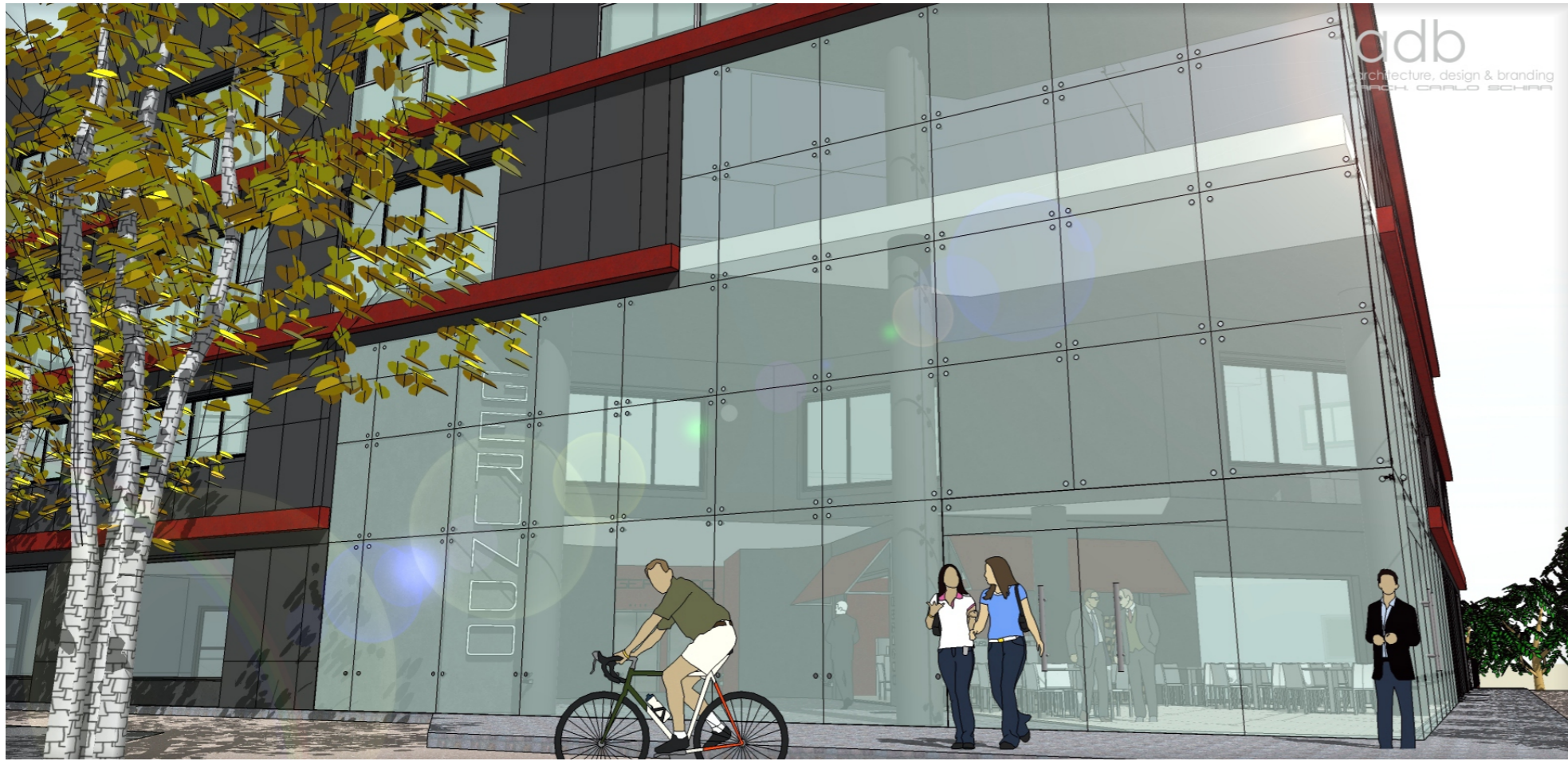
VISTA 03 - INGRESSO EST