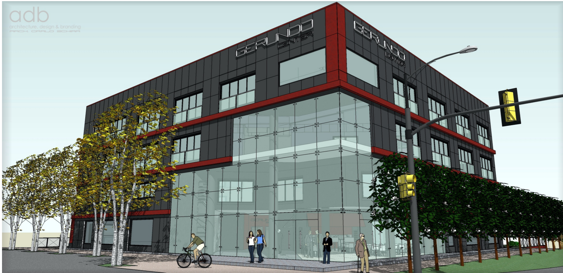
VISTA 02 - PROSPETTI EST - NORD