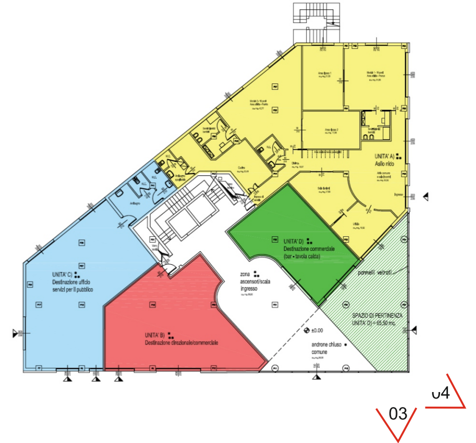
VISTA 04 - ANDRONE INGRESSO